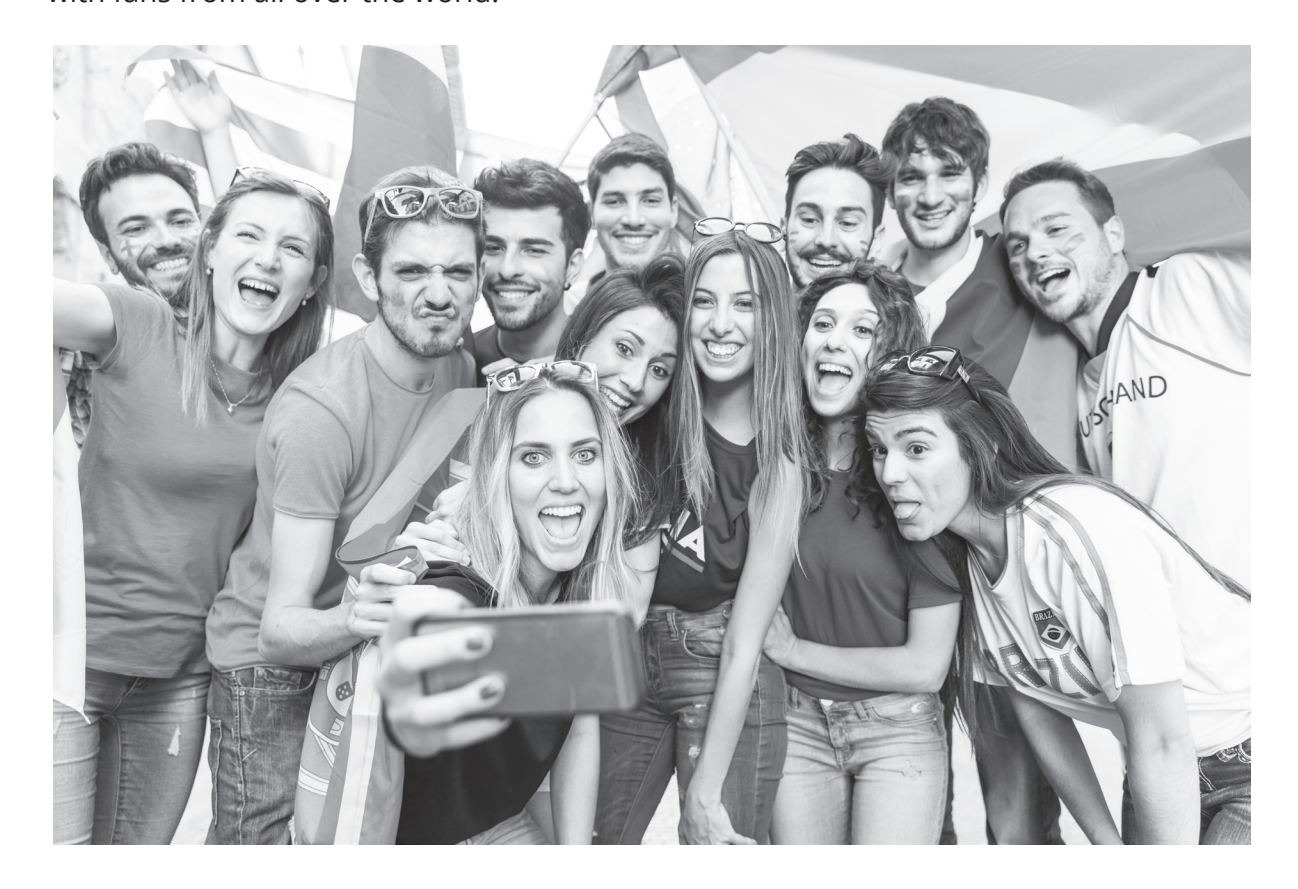
10. For the next class, you are going to work in three groups. Search the Internet for information about the most popular sports in the USA, Canada or Australia. Find out which three sports are most popular to do and to watch there, which sports are considered the national sports, and who the biggest stars are. Prepare a short presentation.