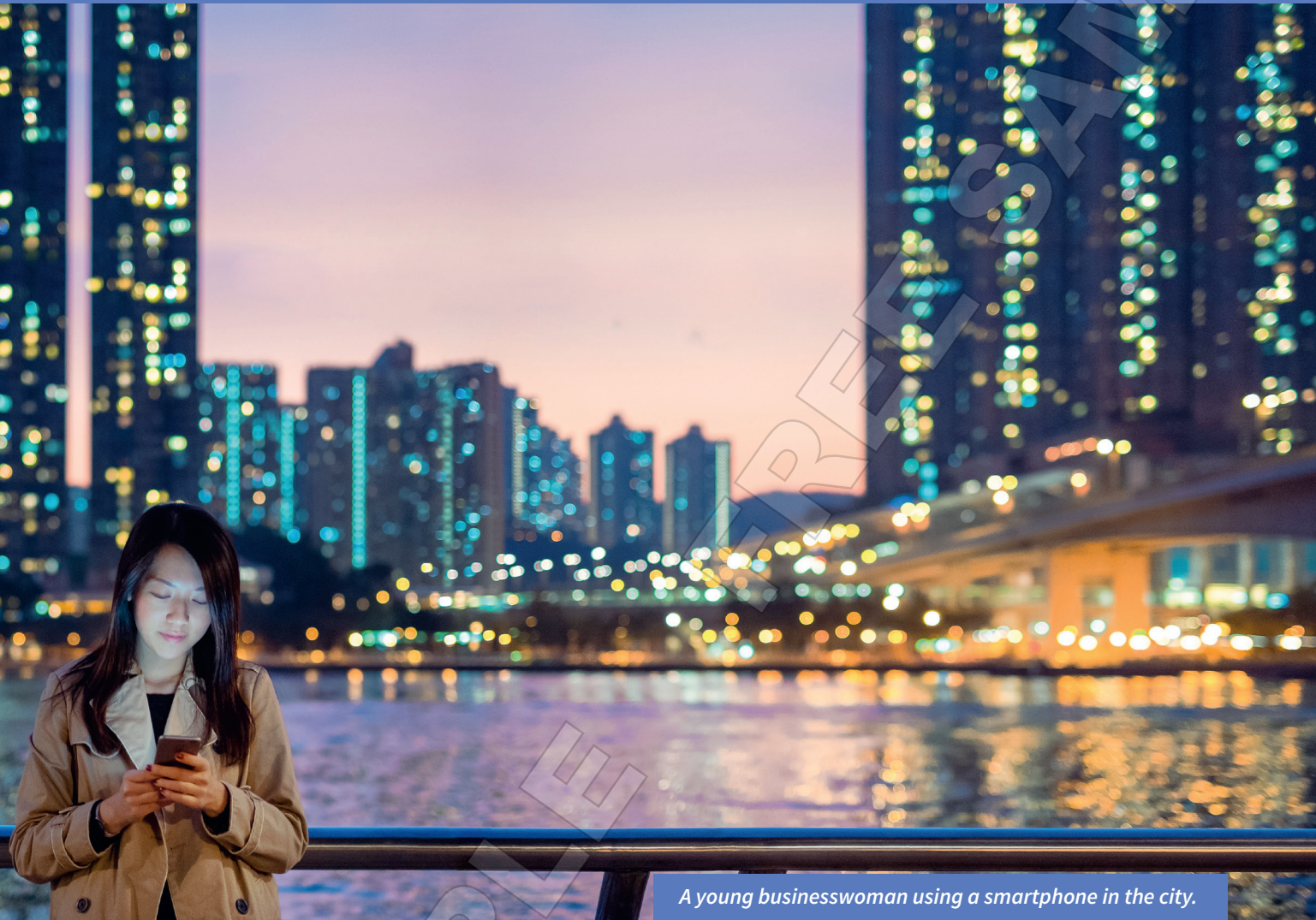
A young businesswoman using a smartphone in the city.