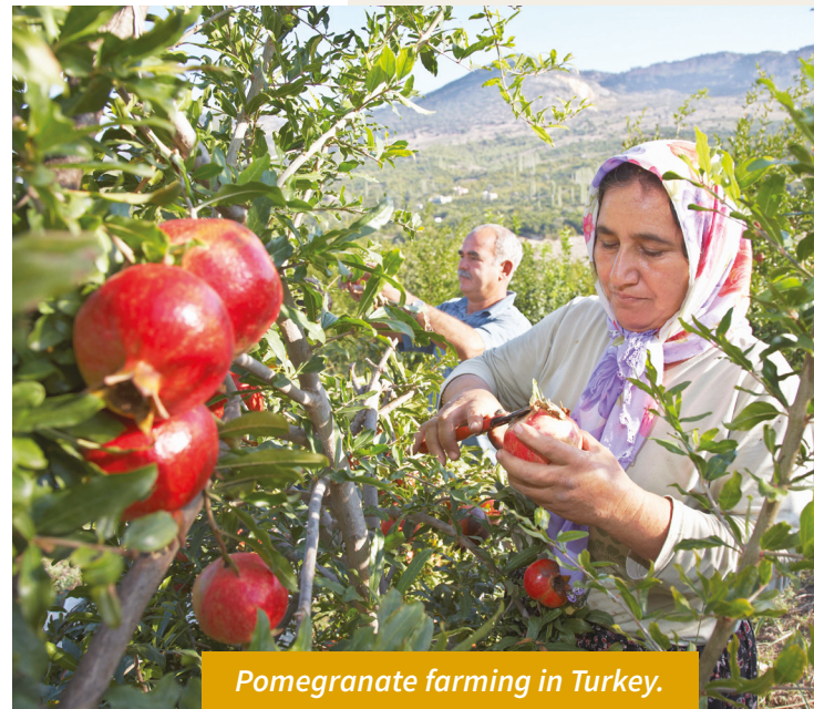
Pomegranate farming in Turkey.