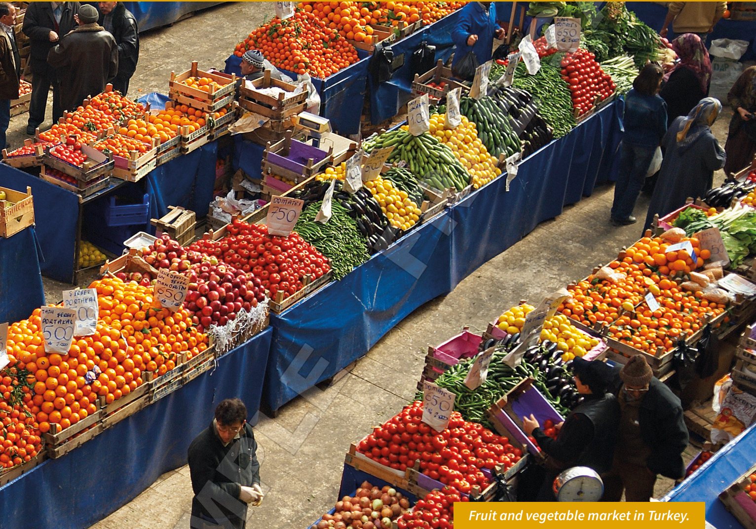
Fruit and vegetable market in Turkey.