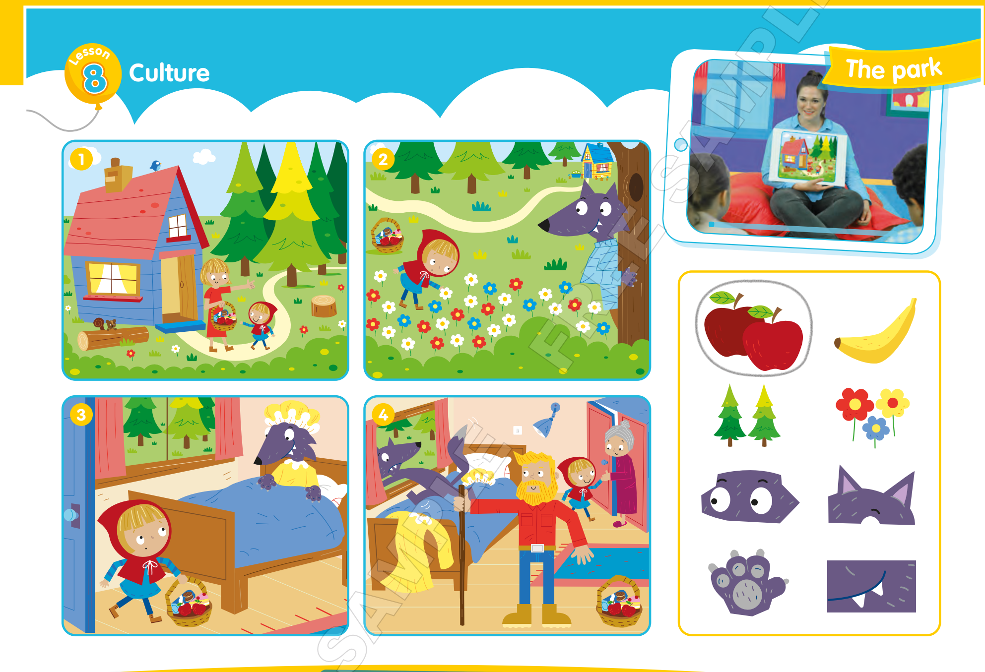
Watch. Listen and point to the story Little Red Riding Hood . Circle the words you hear in the story. Say. Language: apples, biscuits, cake, ears, eyes, flowers, house, path, teeth, trees, wolf; There are (trees).