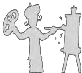
1 a r t i s t

★1 Uzupełnij brakujące litery w nazwach.