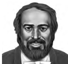
Luciano Pavarotti _____ _____ _____