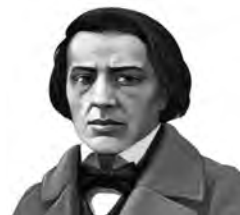
Frédéric Chopin He was a composer.

He was born in 1935. He was Italian. He was Spanish. He was Polish. He was famous for his music for the piano. He was a famous singer. He was born in 1810. He was a composer.