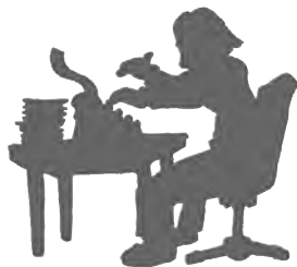
5 w r _ _ e _