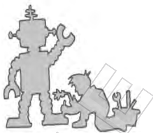
4 i _ v _ _ t _ r