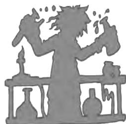
2 s c _ _ _ t _ _ t