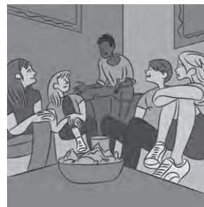
d make new friends