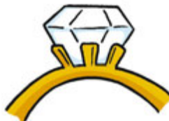
1 _ i _ _