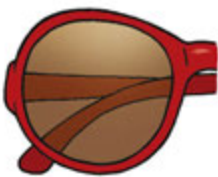
3 _ _ g _ _ _ e _