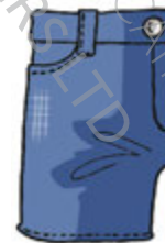
5 _ _ _ t _