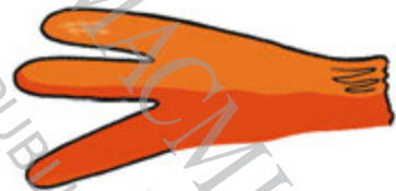
2 g _ _ _