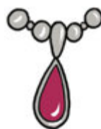
4 n _ _ _ _ _