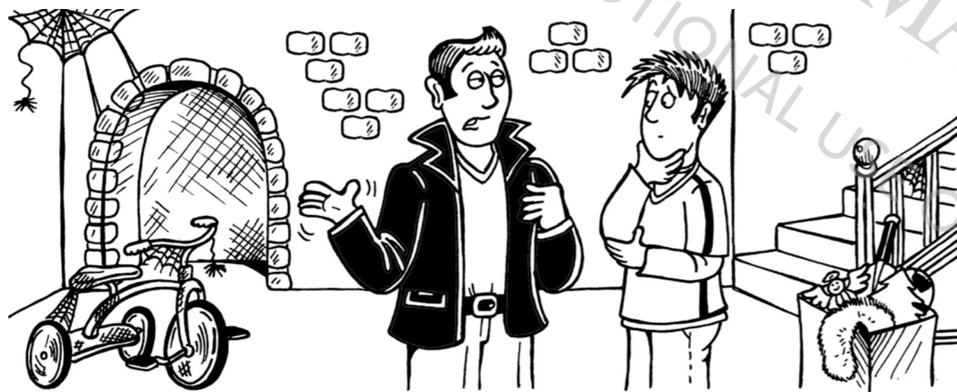
I rarely use my bike these days, so it would make sense if I sold it!