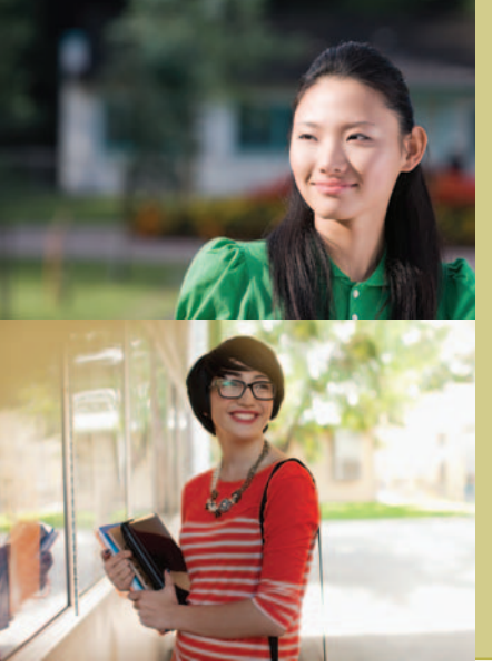
2 What majors are popular in your country?