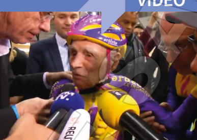
A CYCLING RECORD