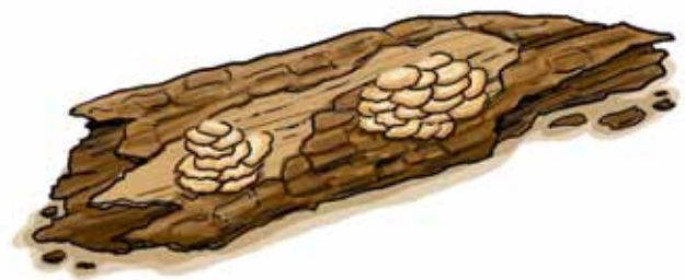
plants die and decay